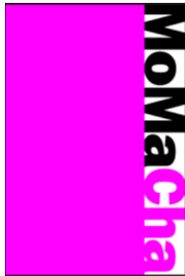
Infringing MoMaCha Image